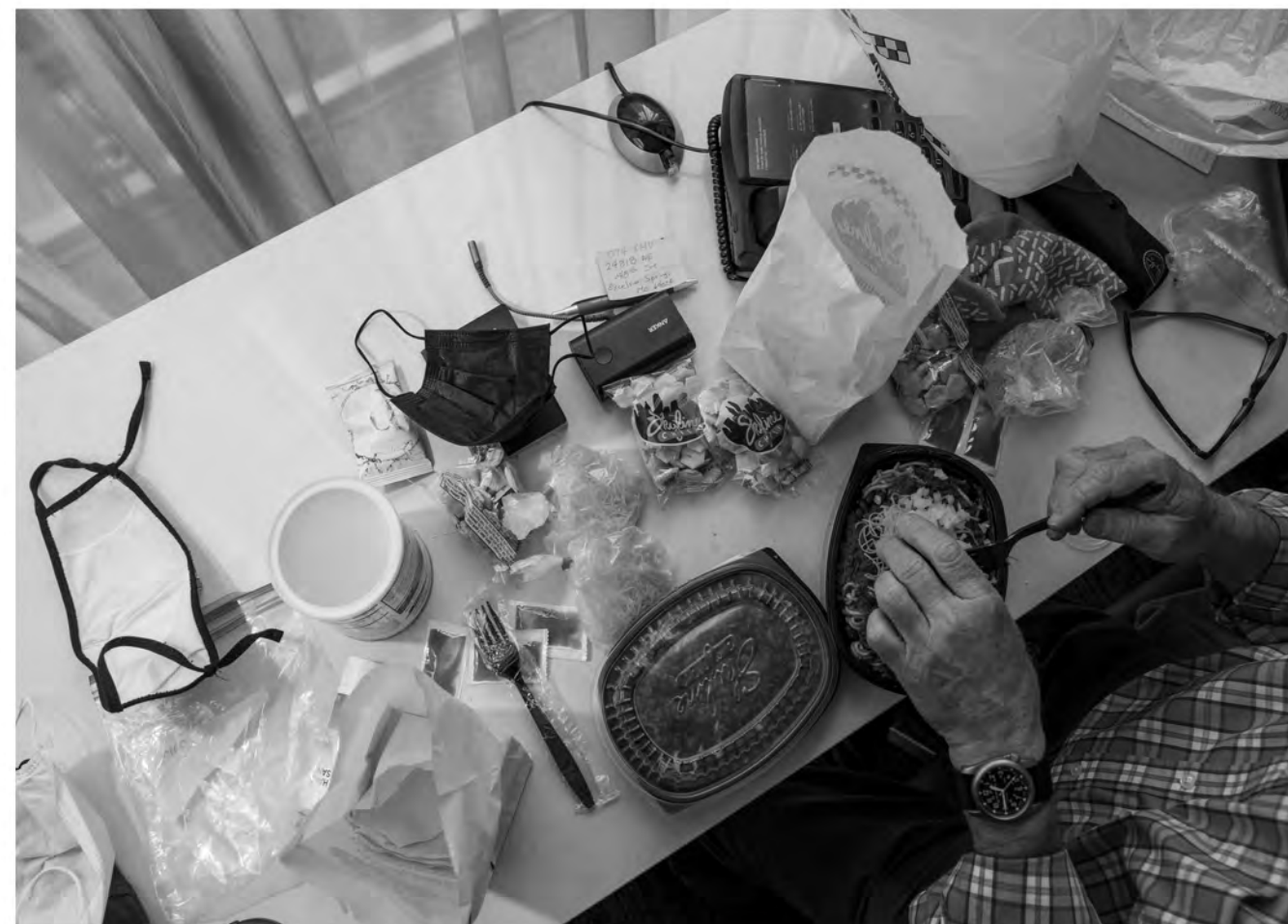
Eating food again was liberating.