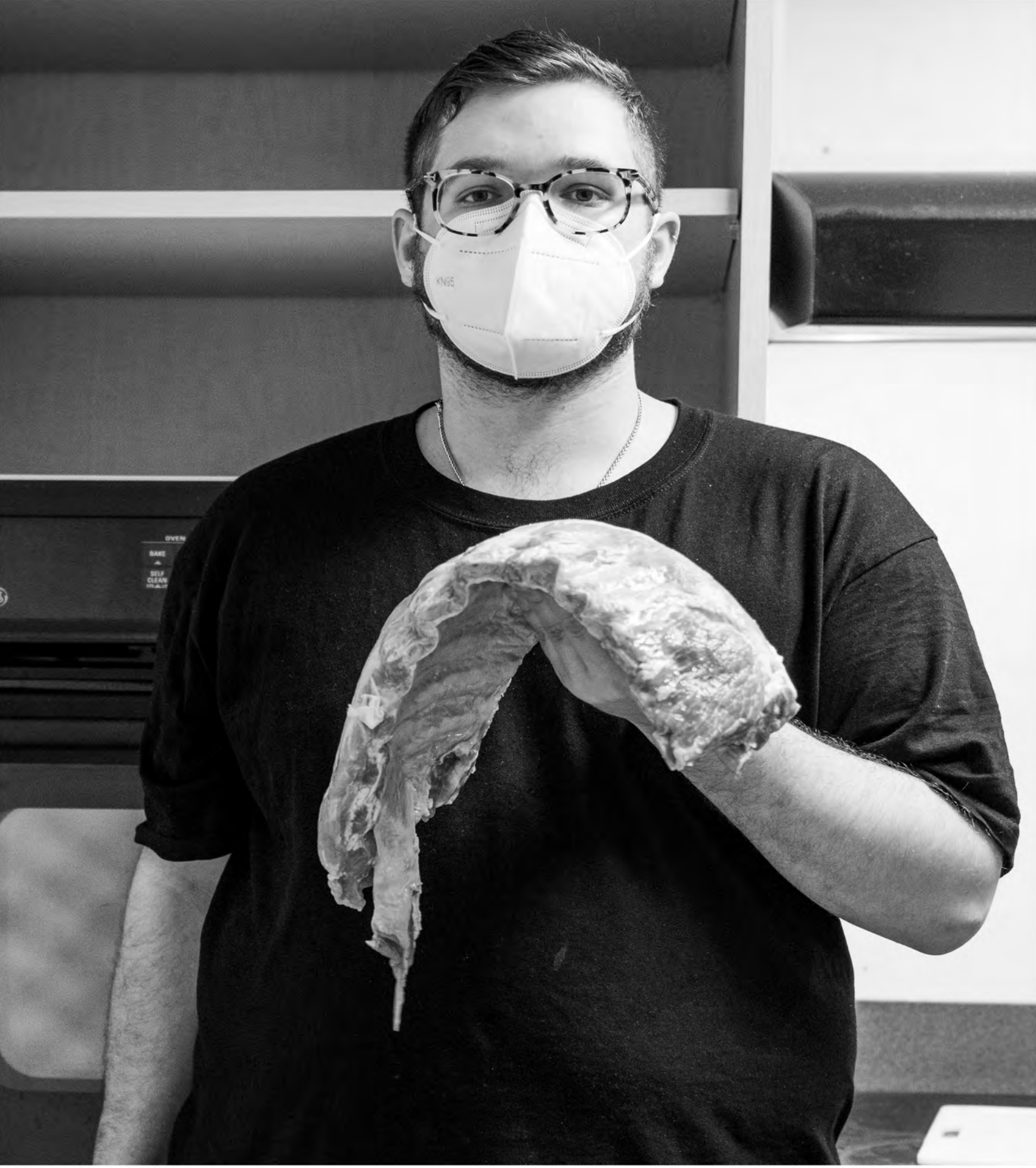
Yet food still disgusts me at times.