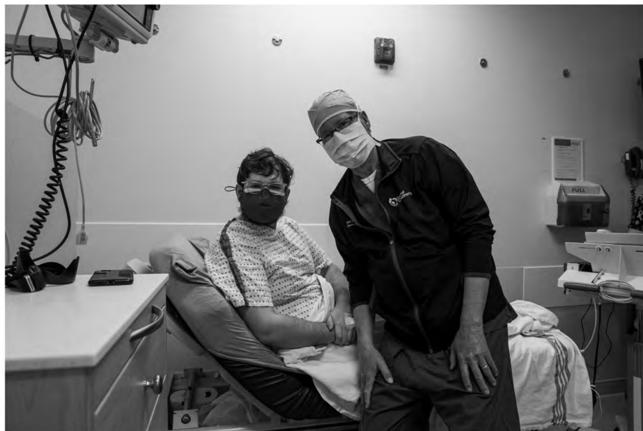
I've been seeing the same doctor since I was 3 years old. He's been one of the most constant things in my life.