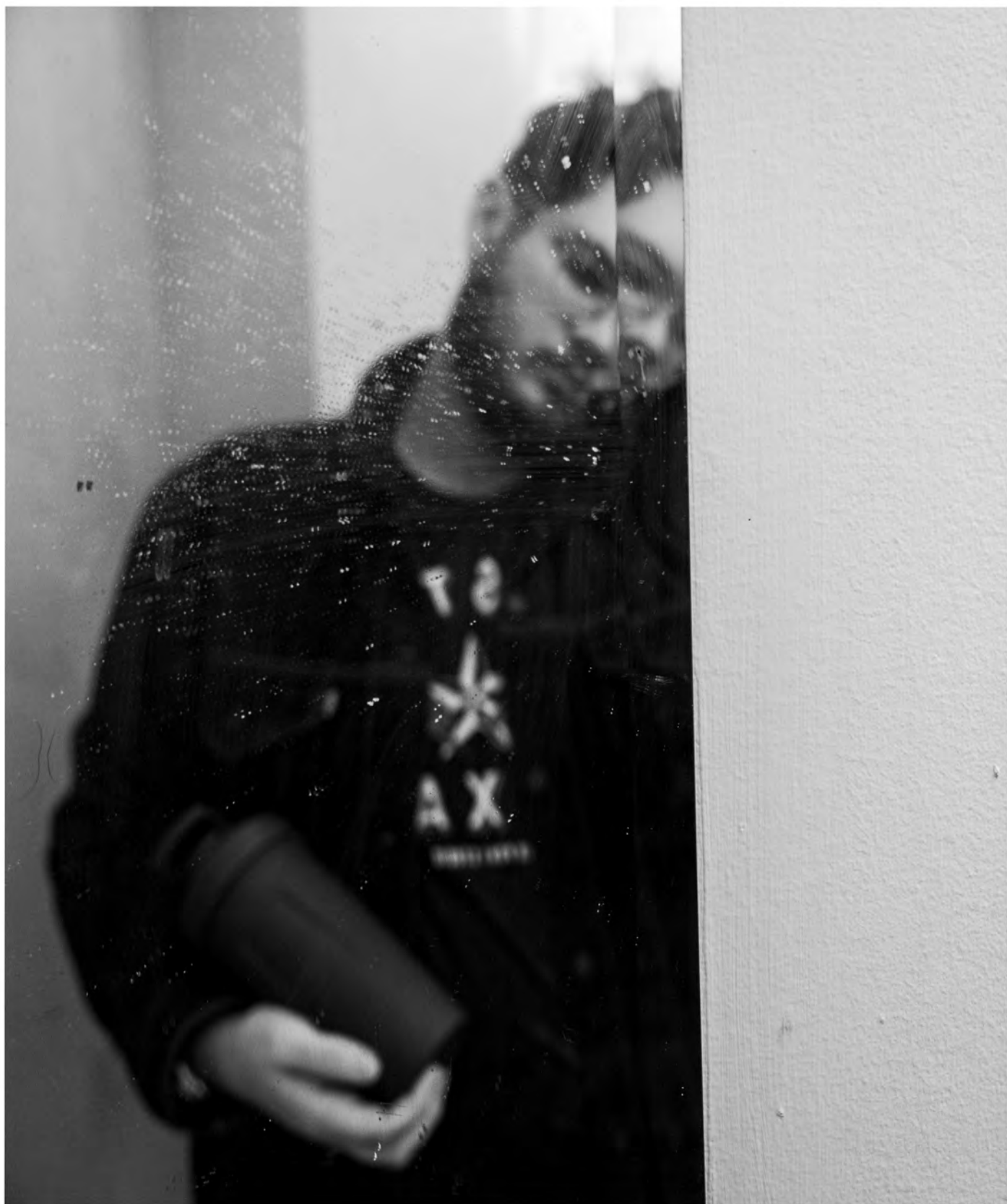
The inability to eat left me isolated. I never before noticed how engrained food was in our culture.