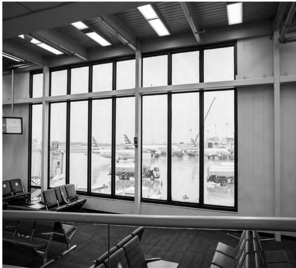
After 3 months, I was able to go to the Childrens Hopsital in Cinncinati for an upper and lower upper and lower endoscopy. Perhaps this would explain while my condition worsened.