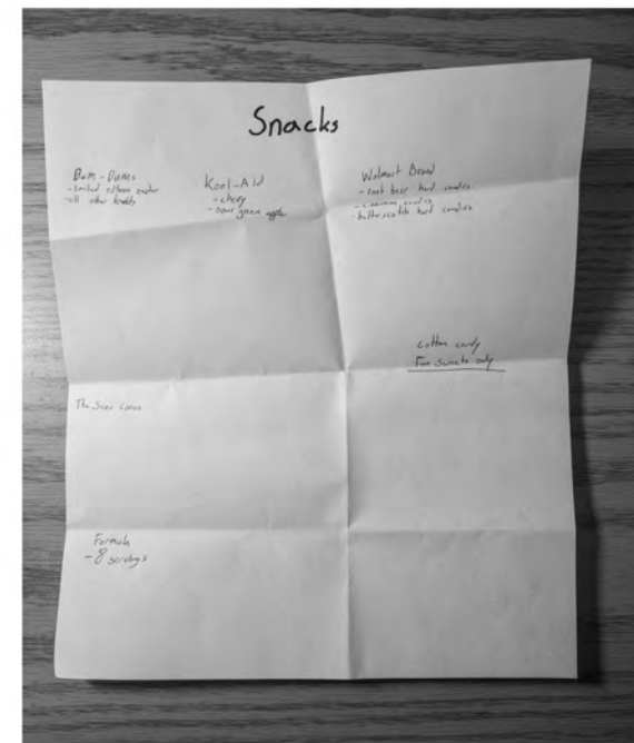
There were few things I was allowed to consume.