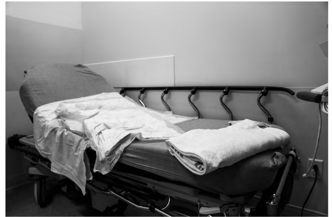
Yet the thought of eating was terrifying. It's hard to associate something so basic with pain.